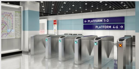
MP access control