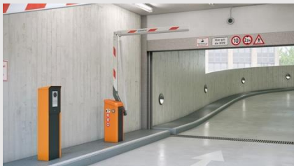
Car park barriers