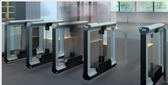
FlowMotion® access control