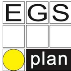
EGS-plan International GmbH