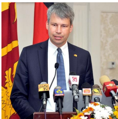
German Vice-Minister of Transport and Digital Infrastructure H.E. Steffen Bilger

Many world's leading companies such as the world's largest logistic company DHL, Hellmann, DB Schenker, Kuehne & Nagel, the world's 5th largest shipping line Hapag Lloyd, Mercmarine, Hamburg Sued and others have been operating in Sri Lanka for decades. In the future they and other new companies could increase their operations and investments with a more optimized regulatory frame. As the official representative of German business in Sri Lanka, AHK Sri Lanka is strongly committed to fair business, level playing field, free trade and liberalization. Until today foreign companies operating in freight forwarding and shipping are restricted to be minority shareholders of max. 40%. Companies that want to provide bonded warehousing services as Multi Country Consolidation need to have a minimum capital of 5 Mio. USD. Therefore, many foreign investors were very reluctant to conduct further or new investments. With the right regulatory frame German Companies could be strategic partners to achieve the targets to become a leading hub in Asia.