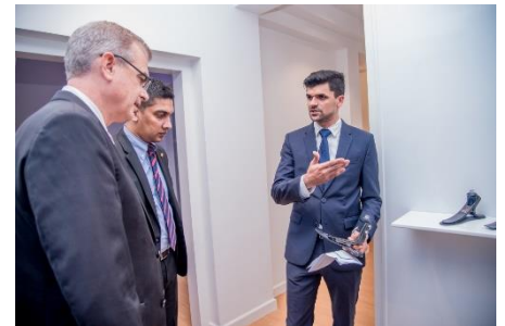
Explaining on the latest high-performance prosthetic feet by ottobock

mobility challenges. Ottobock has been responsible for several innovations in prosthetics, including the C-Leg, a computerized knee that adaptively varies its passive resistance to suit the patients' different walking gaits, and the Michelangelo Hand, a fully articulated robotic hand prosthesis. Ottobock has been a partner to the Paralympic Games since 1988, and an international worldwide partner to the International Paralympic Committee since 2005.