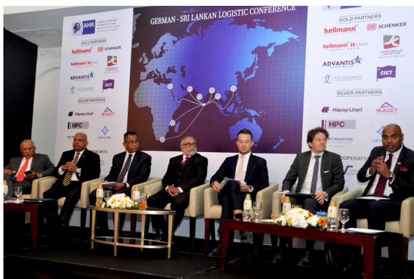
Panel Discussion on the topic of Maritime Strategy in Sri Lanka – Opportunities of cooperation