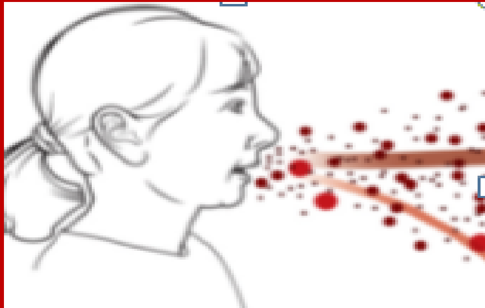
Release of contaminated droplets