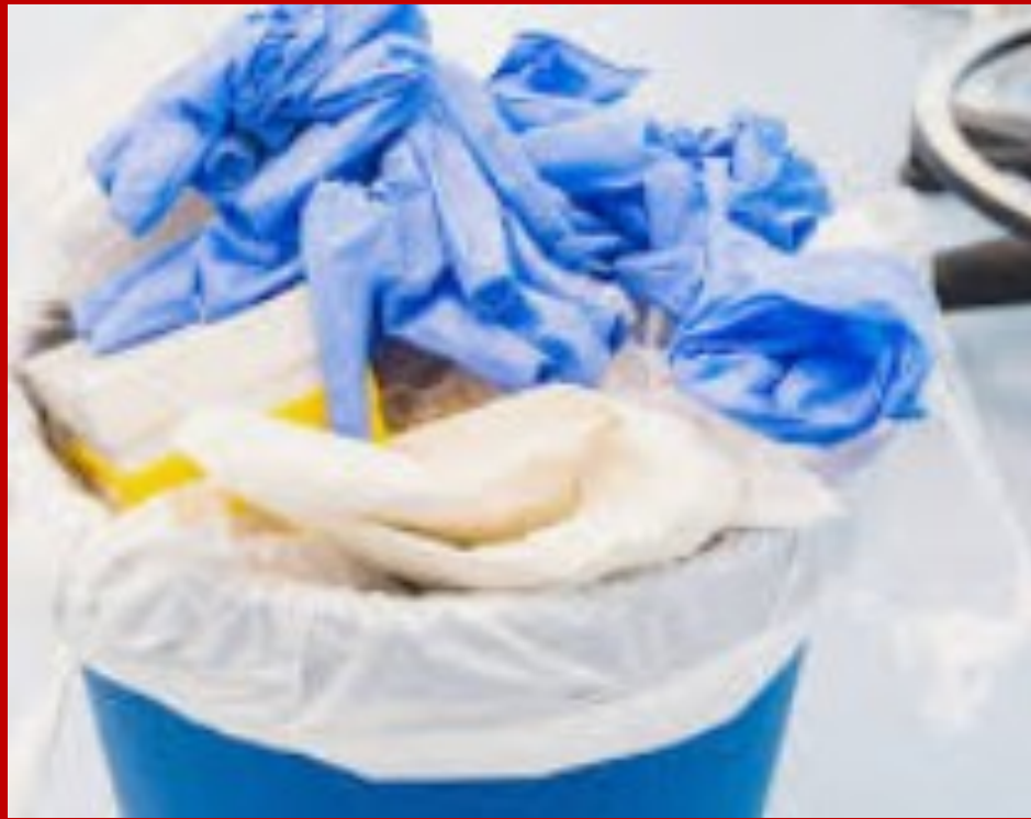
Poor waste storage