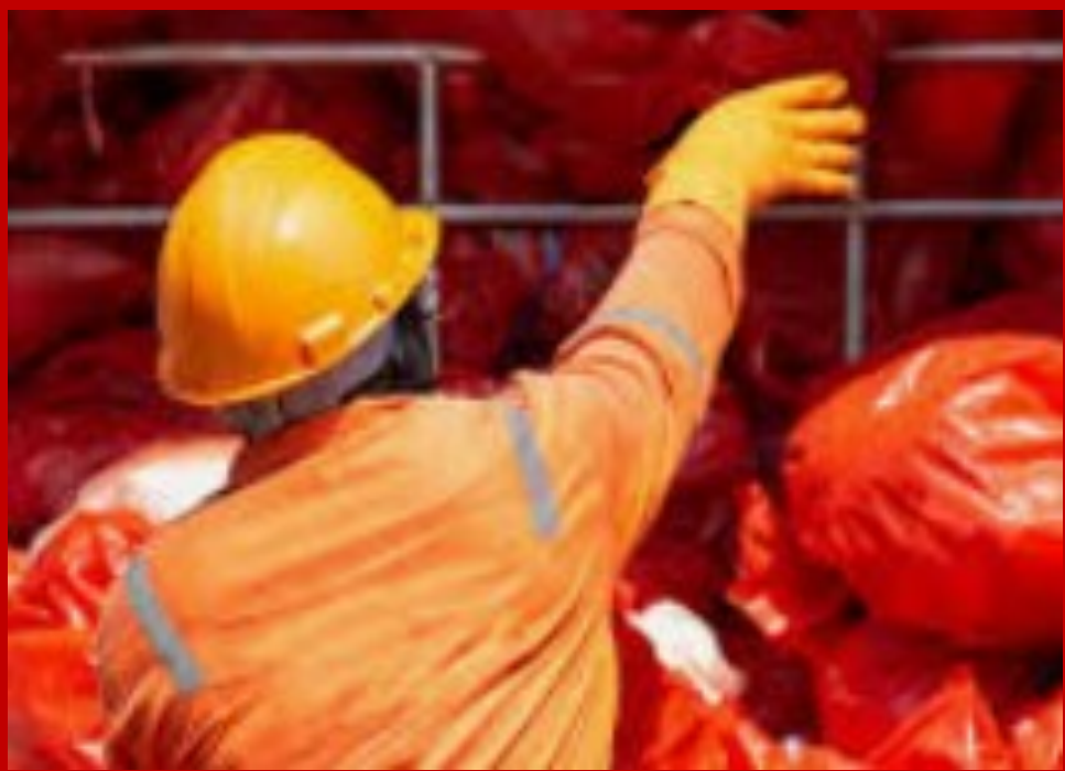
Waste from infected worker