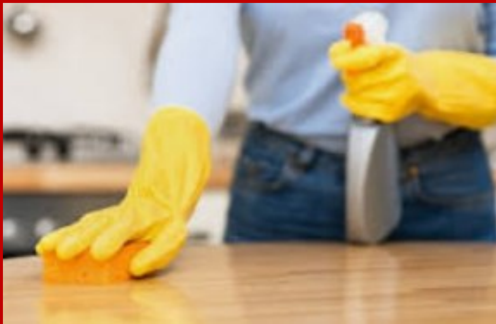
Regular cleaning of surfaces