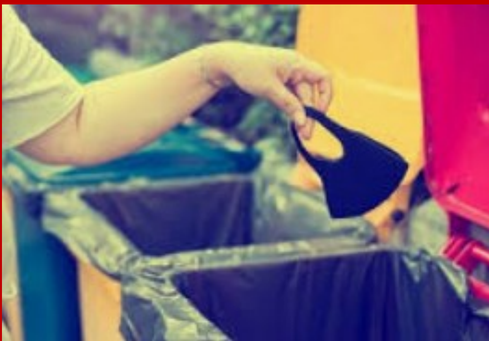
Good waste storage