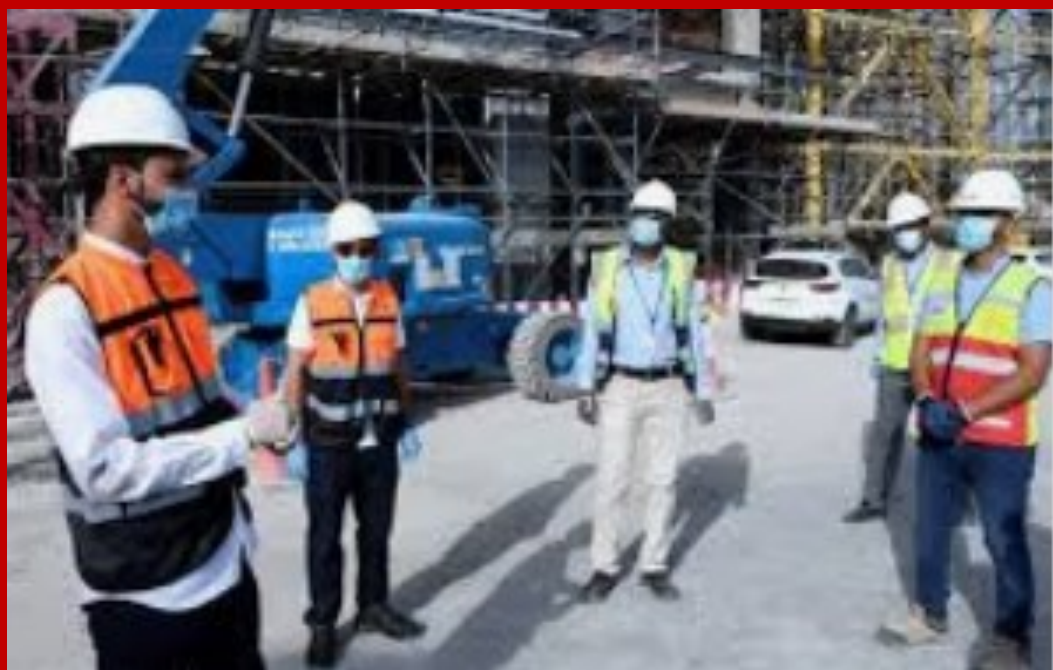
Social distancing on site