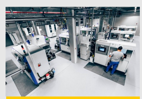
Do Business with AM!