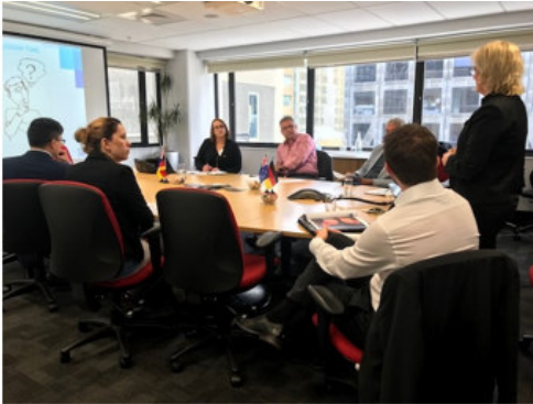
Negotiating with Germans workshop

Under the direction of the Minister for Rural and Consumer Protection of the State of Baden-Württemberg, Peter Hauk MdL, was visiting New Zealand (Auckland and Wellington) from October 29 to November 4 of 2017. The programme was organised with visits and meetings within the agricultural sector focusing on industries in dairy, meat, sheep, viticulture, and forestry. The BW-delegation visited associations, political institutions, forestry parks and research institutions.