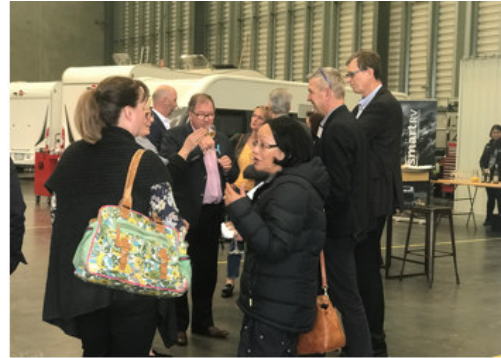
Watch us work @ Smart RV

On the 25 October 2017 we had a great afternoon with Smart RV networking with fellow members and enjoyed a very interesting tour through the company and their beautiful Camper Vans. We held our Negotiating with Germans workshop on the 26 October 17, in Wellington, generously hosted by VTNZ . Attendees were entertained while learning about simple things in communication and behaviour that make up the cultural veneer of a country. You can find more photos on our Flickr page .