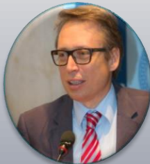
IOANNIS KORDATOS PUBLIC RELATIONS