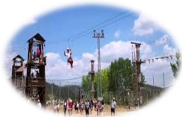
TOURIST PARK NETWORK IN NATURAL AREAS

There is 1 business opportunity with a budget of 4 million dollars in a project about