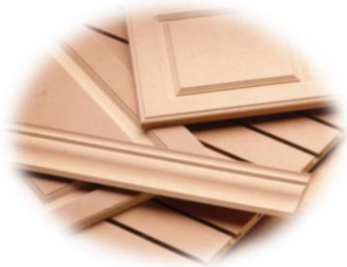
MEDIUM DENSITY FIBER WOODEN BOARDS