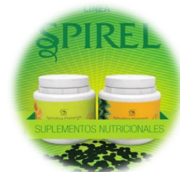
SPIRULINA DERIVATIVES PRODUCTION