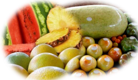
FRESH TROPICAL FRUITS & VEGETABLES

There are 8 business opportunities Ranging from 4 to 23 million dollars with a cumulative budget of 116 million dollars in projects about