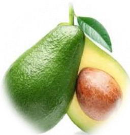
AVOCADO, VEGETABLES & OTHER TROPICAL FRUITS