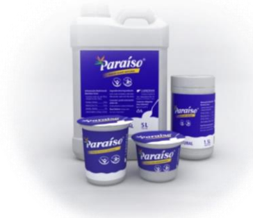
PROBIOTIC YOGURT PRODUCTION