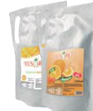
Juice Concentrates & Nectars

Empresa Agroindustrial VICTORIA DE GIRÓN