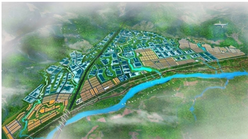
Figure 3: Becamex VSIP Binh Dinh Industrial Park from above

The industrial park has opened in 2020 and the first investor is actually a German automotive supplier. Leonhard Kurz will establish its manufacturing site during 2021 with an overall investment volume of 40 million US-Dollars. This company will produce coatings for car interiors. Its commitment to Binh Dinh and Becamex VSIP shows a glimpse of what the promising future for Binh Dinh might look like.