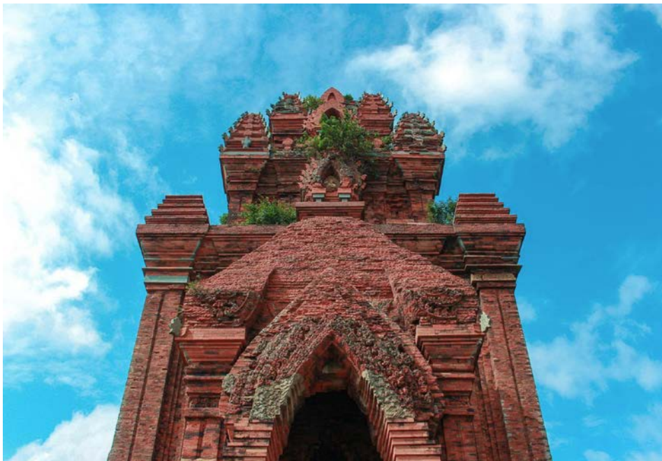
Figure 1: A Cham Tower in Binh Dinh

The first major entry into history books for the region within which Binh Dinh lies today was when the Champa Empire decided to relocate its capital to the city of Vijaya, today's Quy Nhon in 1,000 AD. Champa was a collection of city states focusing on trade as the driver of their economies. In contrast to today's Vietnam with its culture based on the “three teachings” (Mahayana Buddhism, Confucianism, Taoism) influenced by China, Champa`s culture came from India and thus its religion was Hinduism. In Binh Dinh, Champa ruled until 1471 when it got overthrown by Vietnamese forces coming in from the North. Nevertheless, the legacy of Champa can still be seen in the province with its many “Cham Towers”.