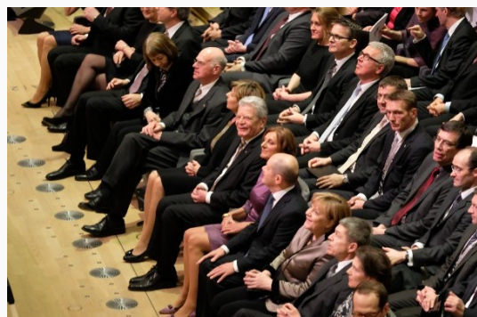
Ceremonial act Grand Hall.