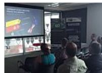
at a workshop, organised and facilitated for NZGBA-member Go Logistics.