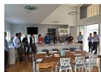
ideal house, full of German know how and products.