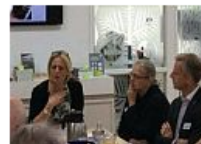
the importance of learning language. Above breakfast at the Goethe Institut.