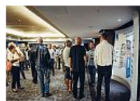
This year's Expert Tour was a sell-out event