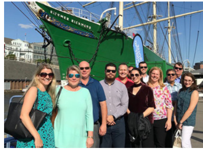
The Future of Smart & Green Ports May | Hamburg, Germany