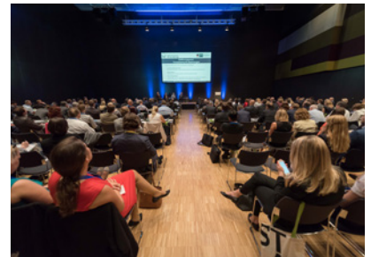
German American Business Forum June | Stuttgart, Germany