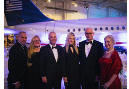
Gateway Award May | Charlotte, NC