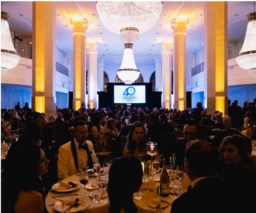
40th Anniversary Gala | October | Atlanta, GA