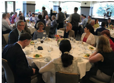
White Asparagus Dinner June | Dallas, TX