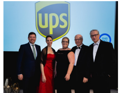
40th Anniversary Gala | October | Atlanta, GA