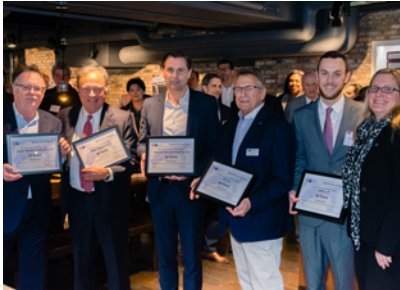
New Year's Reception January | Atlanta, GA