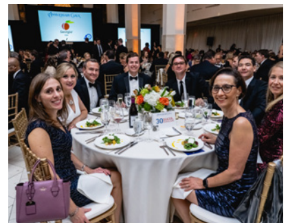
40th Anniversary Gala | October | Atlanta, GA