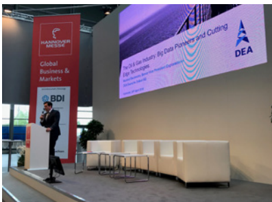
Hannover Fair April | Hanover, Germany