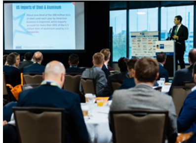
Southern SME Forum April | Birmingham, AL