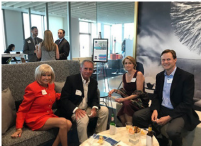
New Member Reception June | Houston, TX