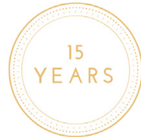
15th Year Anniversary Celebrations

In April, the GACC South Consulting Services department was represented at Hannover Fair in the investment lounge "Global Business and Markets". Companies had the opportunity to schedule individual meetings with our representatives. Additionally, the GACC South participated in other events and presented, among others, a tour around the Global Oil and Gas market.