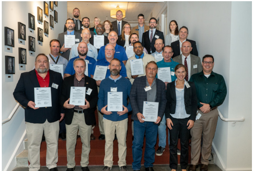
AdA International "Train the Trainer" Graduation Ceremony October | Atlanta, GA