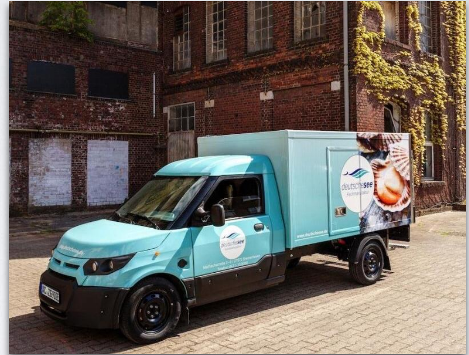
streetscooter in cologne