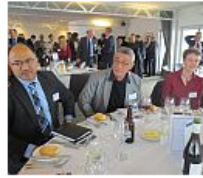
Our guests enjoyed a delicious meal and