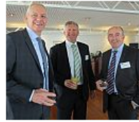
valuable insights into the NZ-DE relationship. For more pictures click here.