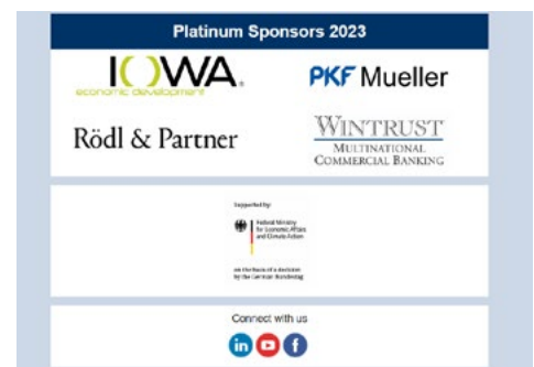
Website & Newsletter