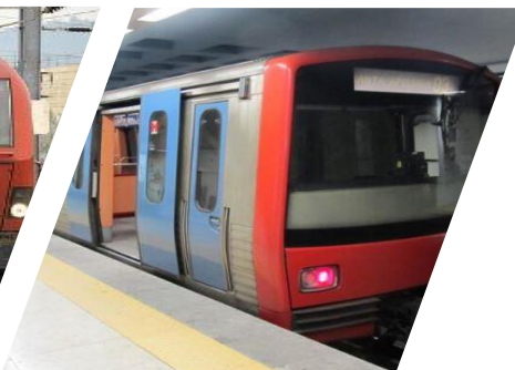
Metro de Lisboa