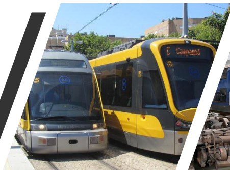
Metro do Porto