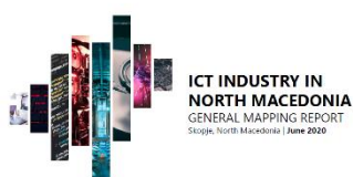
Report on the ICT industry in North Macedonia (2020)

More information about the Macedonian ICT industry can be found in the detailed reports available on the links below: