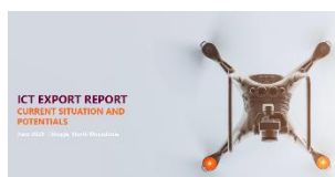
Export report for the ICT industry in North Macedonia (2020)