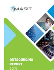
Macedonian Outsourcing Industry Report (2019)